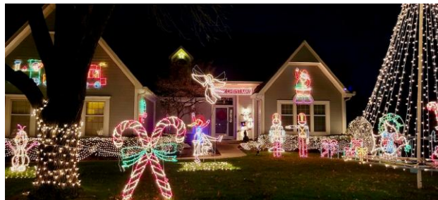
** Best Light Display **