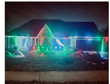
** Best Musical Display **

Last December, we recognized the winners of the Verona Hills Homes Association Holiday Lights Awards. The Best Inflatable Display was awarded to 11542 Baltimore, the Best Lights Display was awarded to 11642 Glen Arbor Terrace, and the Best Musical Display went to 12004 Jarboe – congratulations!