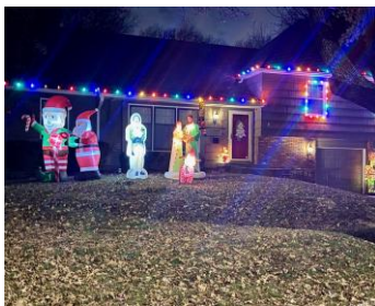
** Best Inflatable Display **